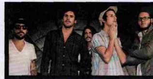
THE NEW LIMB PHOTO COURTESY OF BAND; AVI BUFFALO PHOTO BY EDE MCCONNELL; THE UNION LINE PHOTO BY DAVEY WILSON